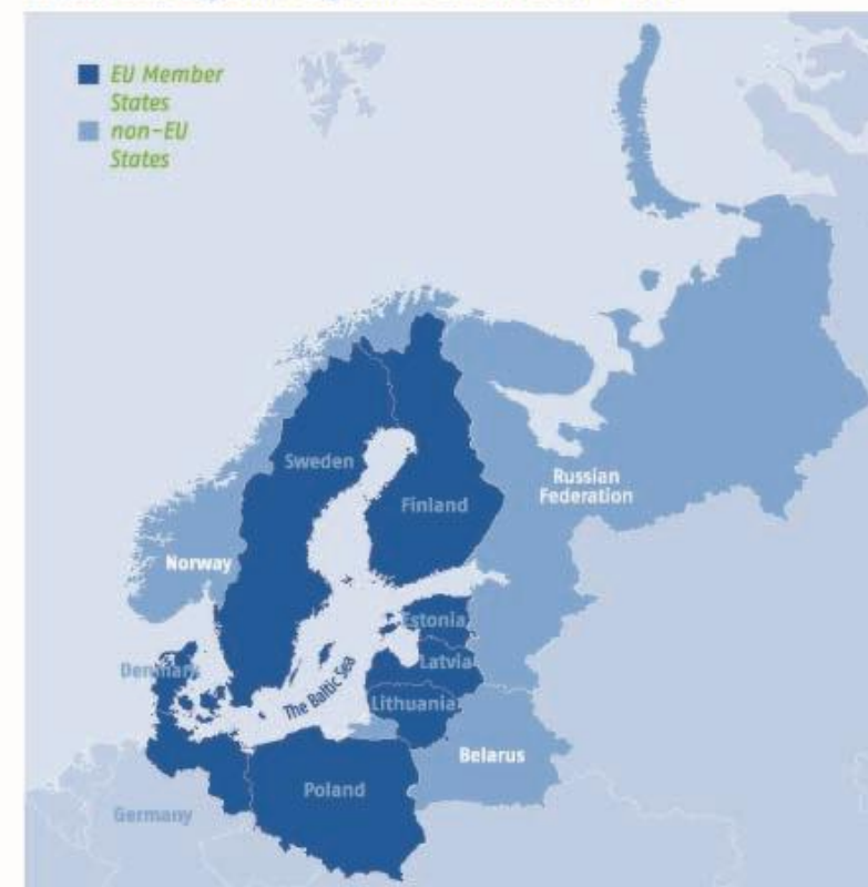
Baltic Sea Region Programme area 2007 – 2013

The future programme is currently being drafted